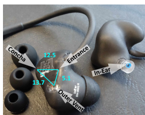
Figure 1: Image of earpieces, including distances between microphones (centres of ports) and assigned microphone names.

Each unit includes one pair of earpieces, and 16 silicone domes in 4 sizes. The device is functional with other domes, but for comparability we recommend to use the ones supplied. Additional earplugs can be ordered at InEar, Germany. Replacement Cerumen Filters (type HF4) are not included, but can be reordered.